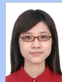
Frame too thick