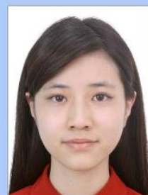
Head too big