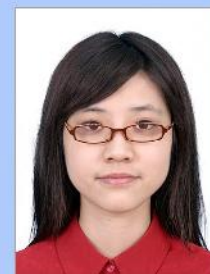
Frame covering eyes