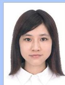
Clothes color identical to background