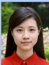
Background not plain