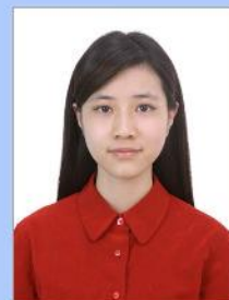
Head too small