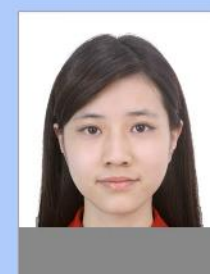
Damaged photo or other defects