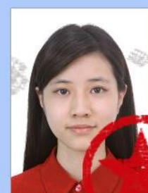
Stamp or other patterns on photo