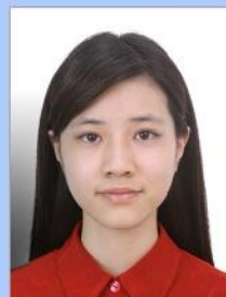
Shadows on background