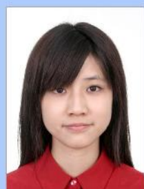
Hair covering eyes, eyebrows or ears