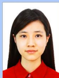
Contrast too high