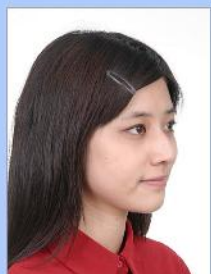
Not facing camera