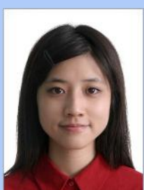
Shadows on face